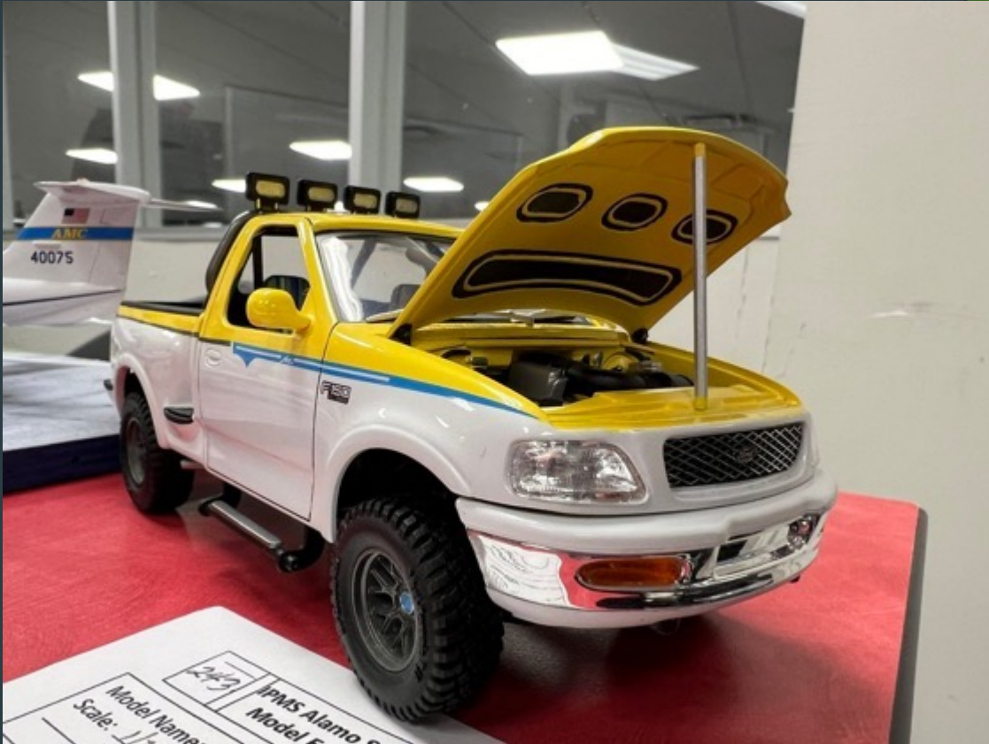
1997 Ford F-150 Scale 1/25 By Keith Rule