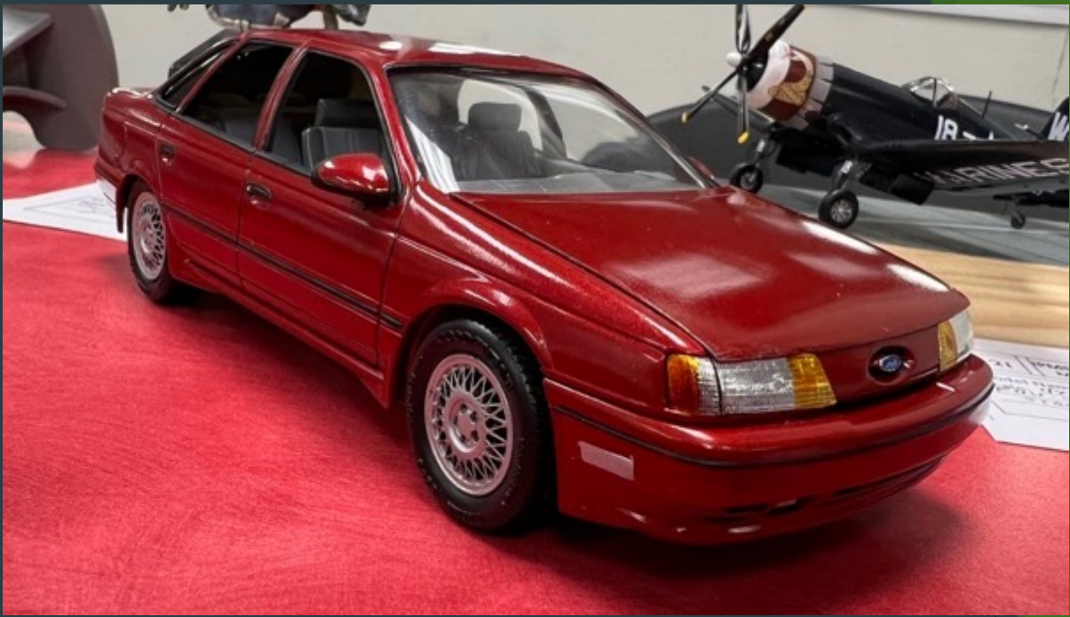
1989 Taurus SHO, 1/25 scale by Jonathon Griffith