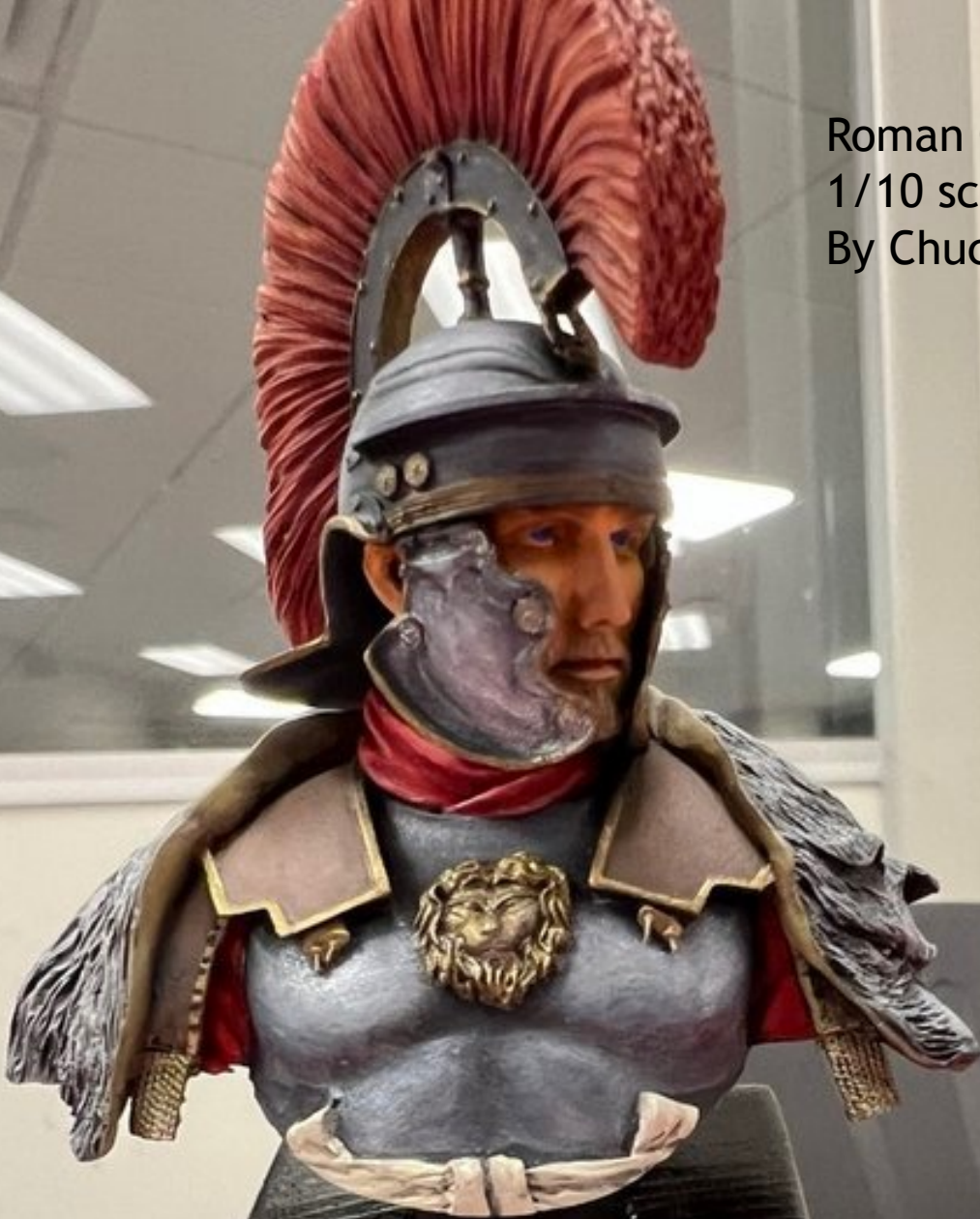
Roman Centurion 1/10 scale By Chuck Blair