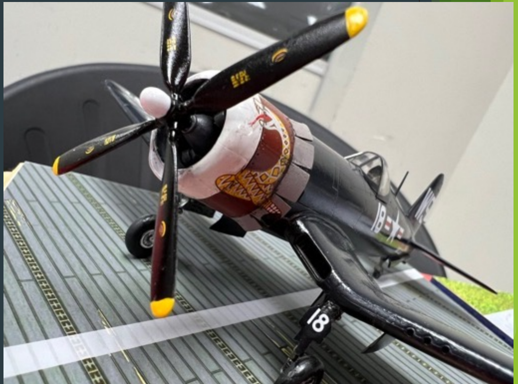
F4U-4 Corsair, 1/72 scale By Julio Caro