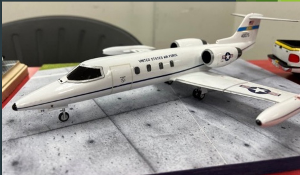
Lerajet 35A built as a USAF C-21 1/48 scale By Julio Caro